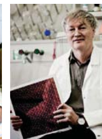
Michael Graetzel (Switzerland)

Rzhanov Institute of Semiconductor Physics of Siberian Branch of Russian Academy of Sciences