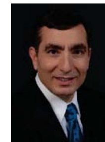
James M. Tour (USA)