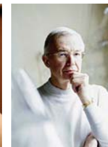
Jean-Marie Lehn (France)

University of Strasbourg invited, to be confirmed